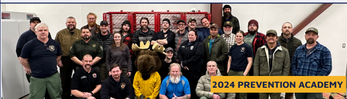
2024 PREVENTION ACADEMY

Public Education, Enforcement, and Community Outreach