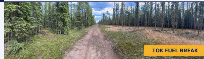
TOK FUEL BREAK

Resilient Landscapes and Fire Adapted Communities.